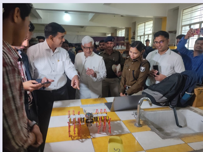
Exhibition was organized by Sityog Institute of