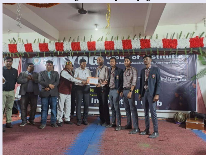
Technology in Aurangabad, Bihar. The winning project,